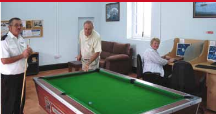
The Seafarers' 'Drop In' Centre at Gibdock Main Entrance provides seafarers with a place to relax and offers TV, Pool, Internet and Telephone facilities.