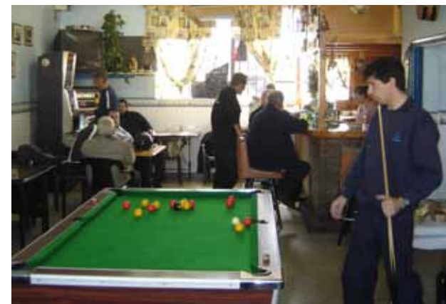
Seafarers relax in the welcoming atmosphere of the Gibraltar Seafarers Centre